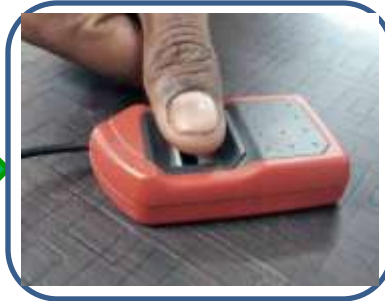
Biometric Registration at Meeseva Centre/OTP registration through TSMIP website